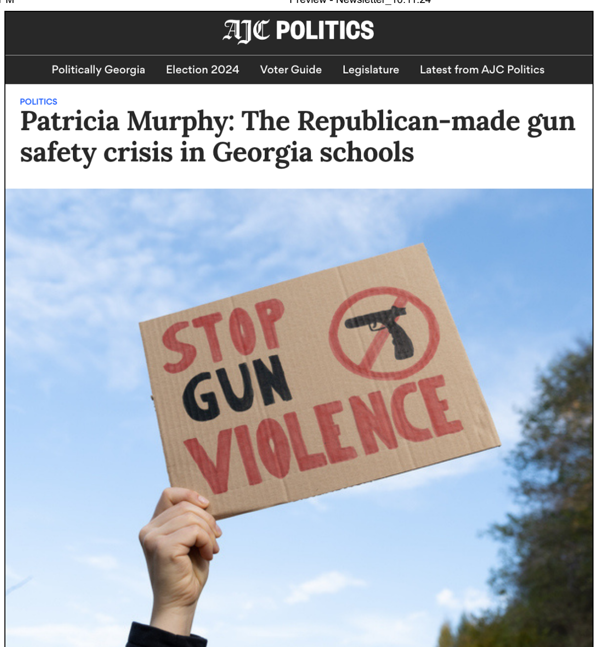
<u>Click here for full article</u>

The fact is that <u>secure gun storage laws decrease firearm injuries and deaths</u> <u>among minors</u>. I am dismayed that we missed this opportunity to prevent this and countless other incidents of gun violence in our communities. I am even more dismayed to hear that, even after the deadliest school shooting in Georgia history, <u>our own Governor refuses to act</u>.