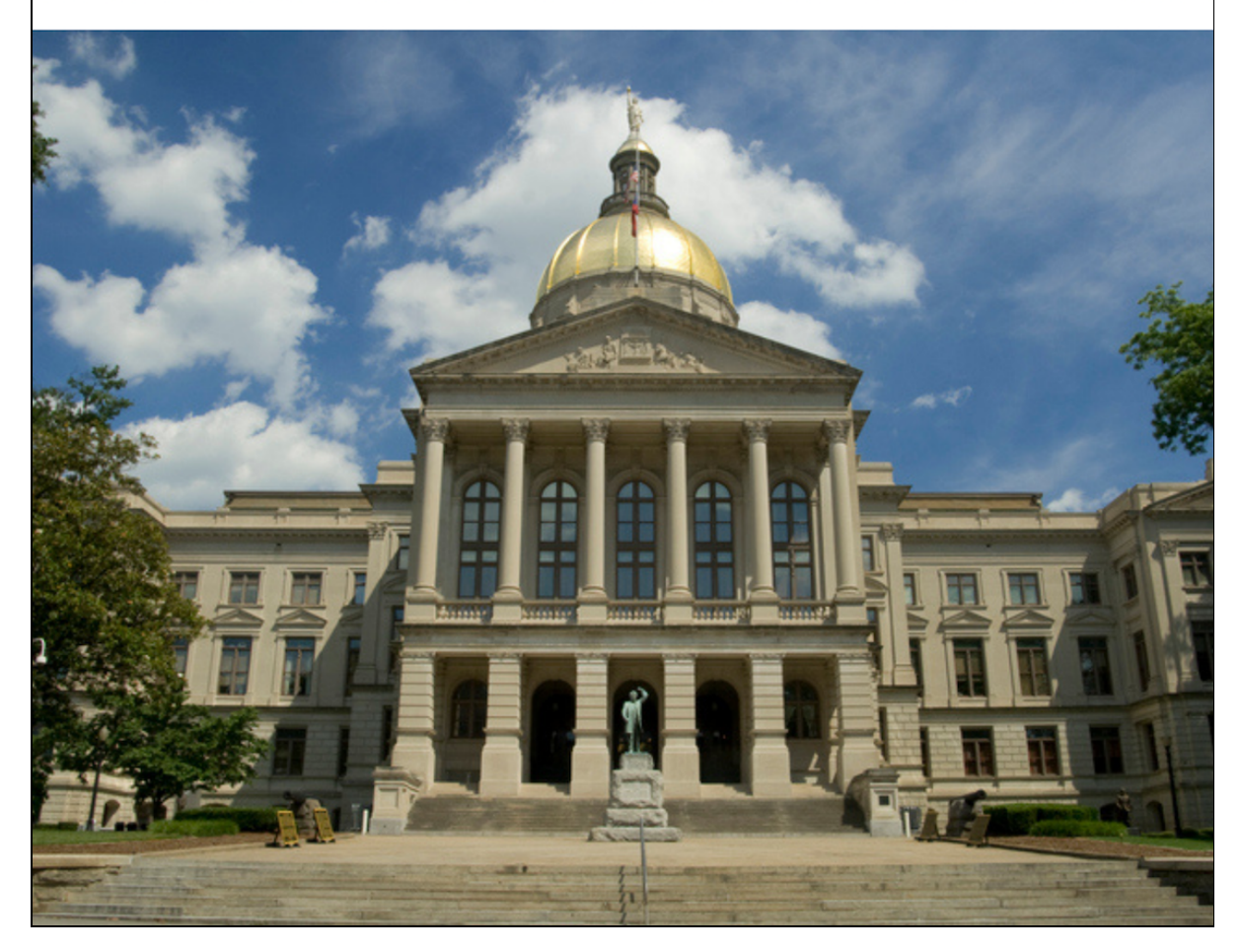
Click here for full article

Your daily jolt of news and analysis from the AJC politics team