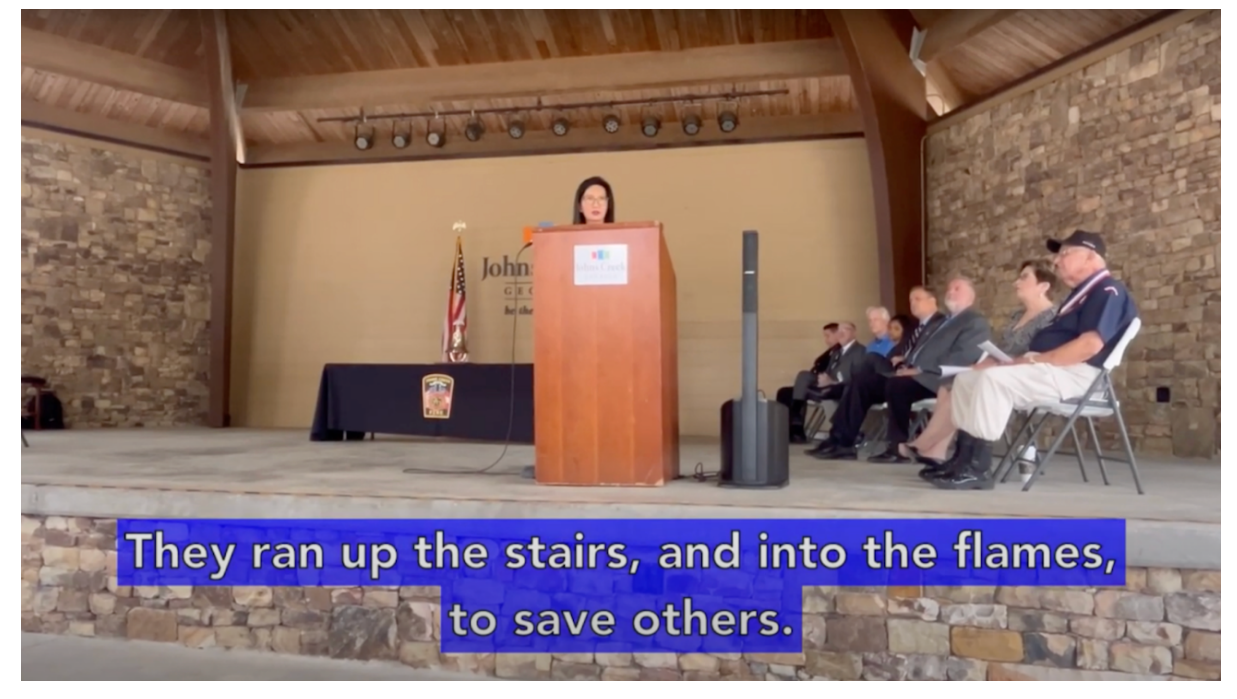
<u>Click here for full video</u>