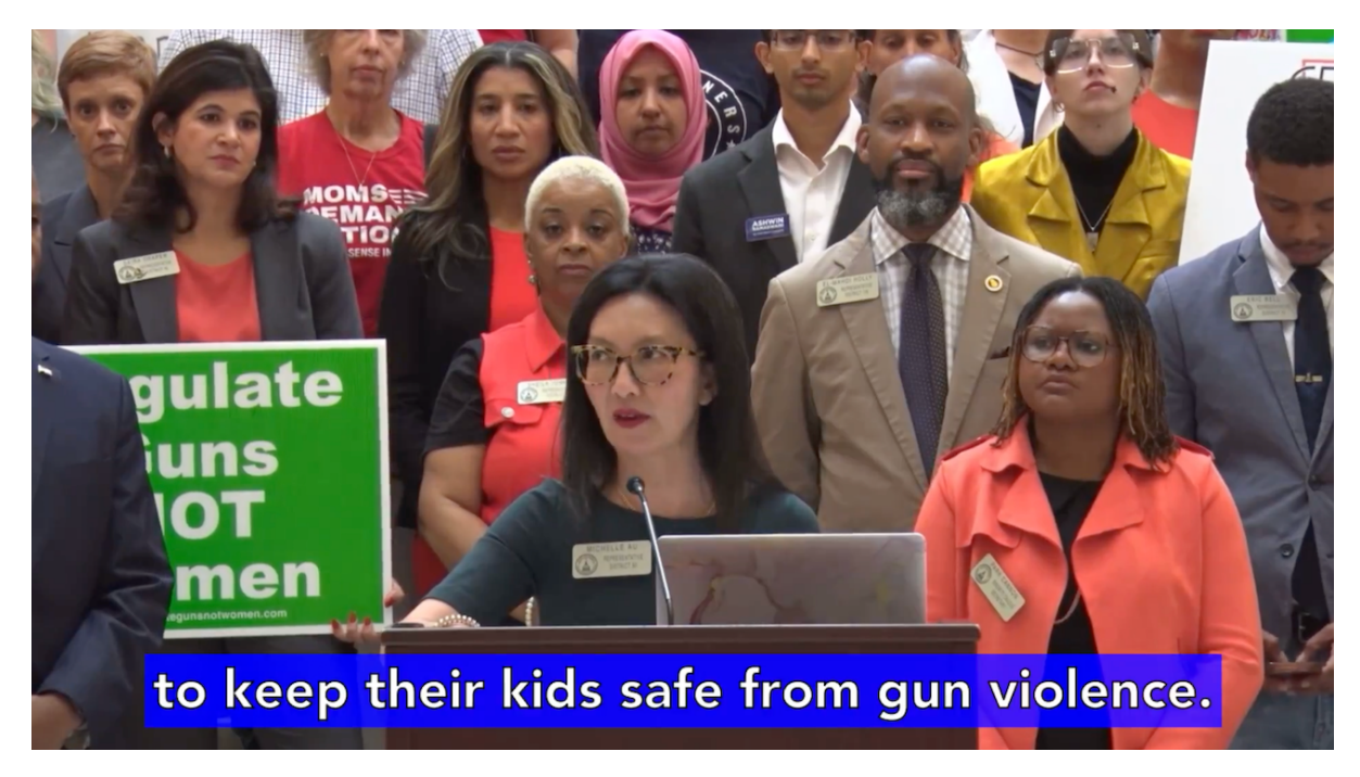
<u>Click here for full video</u>