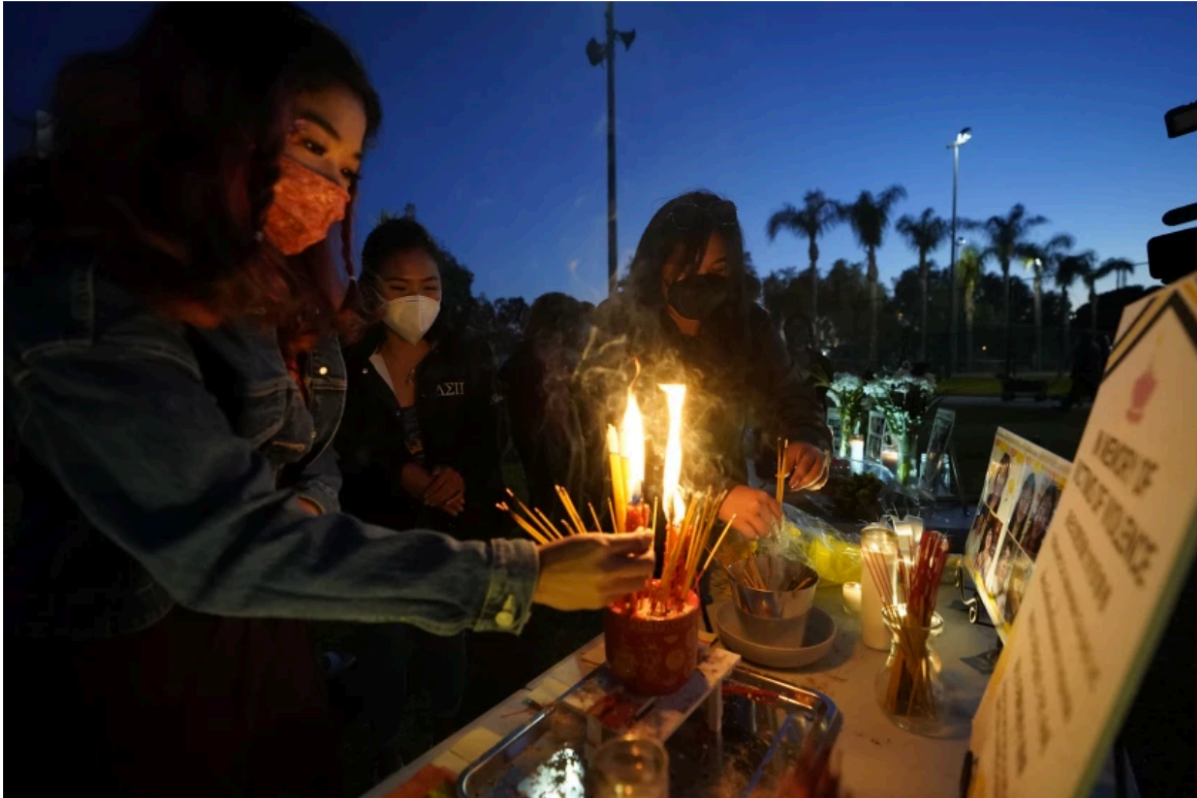
Women at a March 27 candlelight vigil in Monterey Park pay their respects to the eight victims of the spa shootings in Georgia.