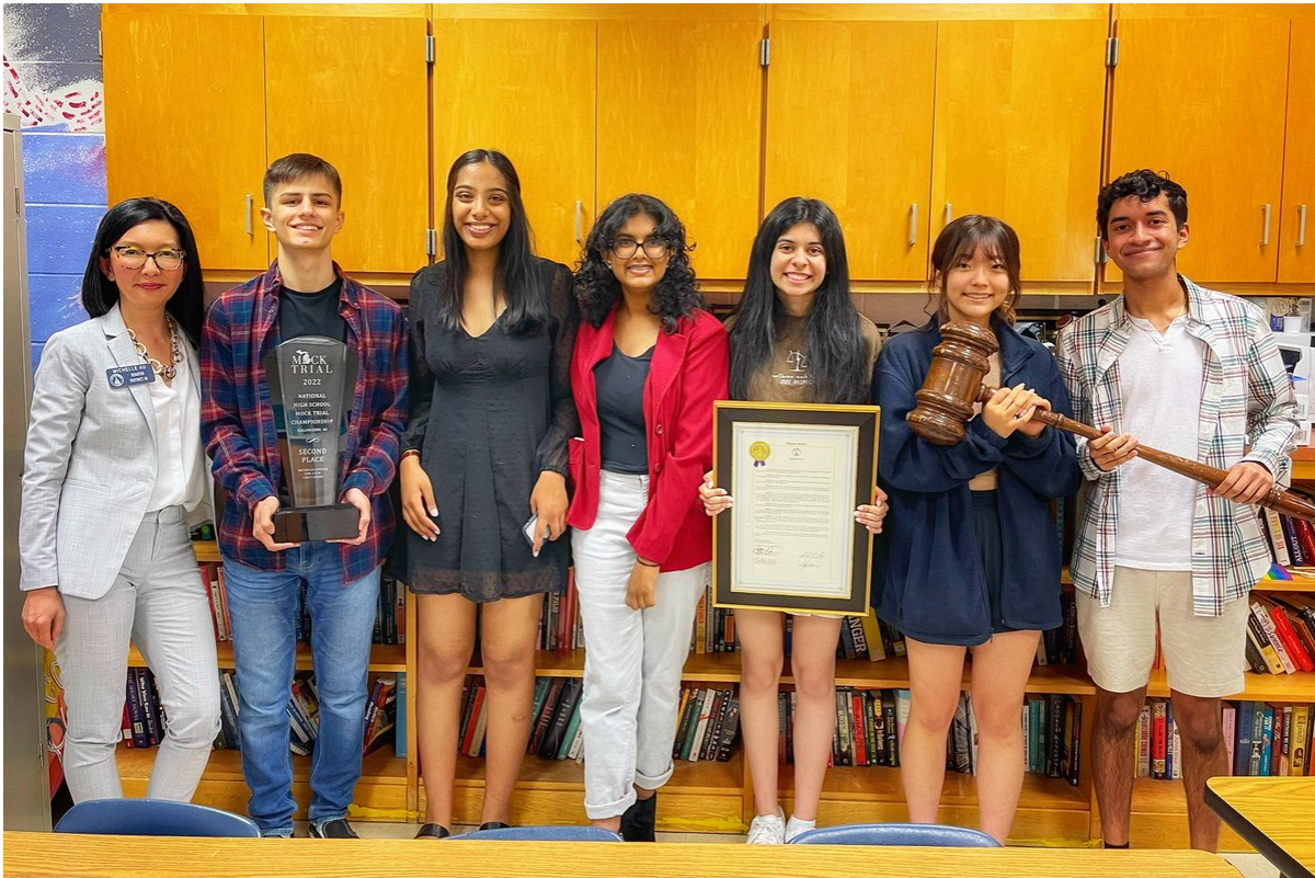
On May 20th, it was my honor to present a Senate Resolution to the Northview High School Mock Trial Team for placing 2nd in the NATIONAL High School