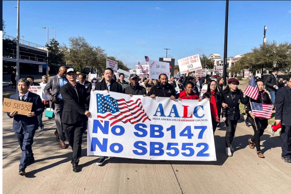
Protesters in Houston last week rally against a proposed state Senate bill that would restrict citizens of China and three other countries from buying property in Texas.

“I have never seen the Chinese community this active and this motivated in my entire adult life. The community is inflamed right now. They are enraged.”