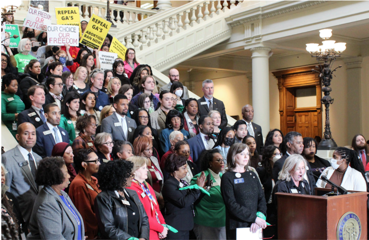
Members of the Georgia House and Senate introduced the Georgia Reproductive Freedom Act during a press conference at the Capitol on Tuesday, January 24, 2023. The elected officials were joined by a cohort of allies, including representatives from the organizations Amplify Georgia, Access Reproductive Care - Southeast, Feminist Women's Health Center, NARAL Pro-Choice Georgia, SisterSong Women of Color Reproductive Justice Collective, SPARK Reproductive Justice Now!, Women Engaged, and YWCA of Greater Atlanta.

Watch the official Georgia Democrats response to the 2023 State of the State address HERE .