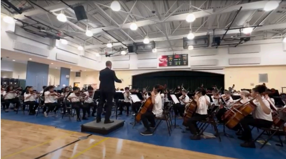
Listen to the 6th grade orchestra perform "Subatomic"

I enjoyed watching the Autrey Mill Middle School 6th, 7th, and 8th grade orchestras perform at their pre-Large Group Performance Evaluation concert this week!